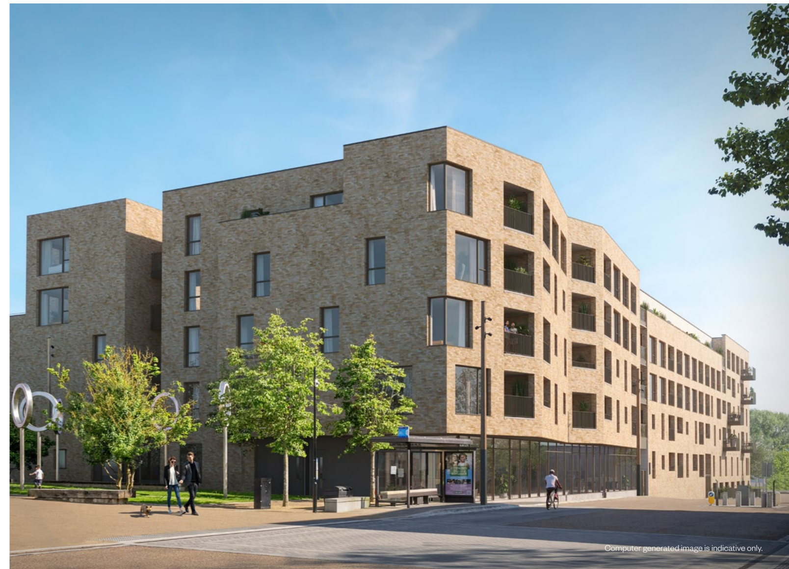
Computer generated image is indicative only.

◄ = Measurements C = Cupboard W = Wardrobe U/S = Utility/Store cupboard W/D = Washer/Dryer HR = MVHR R = Riser cupboard □ = Indicative wardrobe position